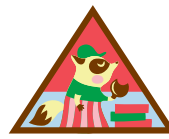
Cookie Decision Maker