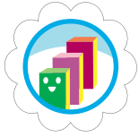
My First Cookie Business

2. Earn one of the Cookie Business badges to help you discover new skills. Each badge has digital marketing skills built right in.