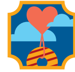
My Cookie Business Resume