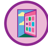
My Cookie Team