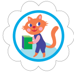
Cookie Goal Setter