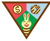
My Cookie Customers