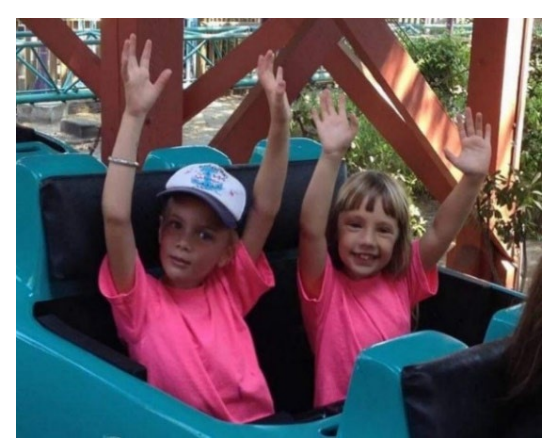
Troop Trip Approval may be required